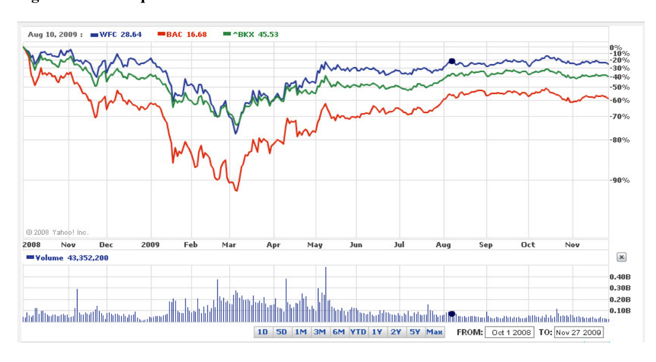
Figure 2. Post-Acquisition Stock Performance

BAC after buying MER posted a loss of about $2.4 billion in for the quarter ending December 2008. BAC also lost about $1 billion for the third quarter of 2009. For the period, BAC reported that its personnel costs and operating costs increased to $16.3 billion from $11.7 billion previous year, mainly due to MER acquisition<sup>21</sup>. MER continues to be a loss making center for BAC as mentioned BAC in its 10Q of Q3 09 -"net loss increased as higher gains on the sale of debt securities and higher equity investment income were more than offset by the negative credit valuation adjustment on certain Merrill Lynch structured notes." This could also be seen reflect in Figure 1 showing that BAC's Value added Risk increased after the acquisition of MER and is yet to return to its pre-acquisition levels. For the quarter ending December 2008, WFC posted a loss of $2.55 Billion after the acquisition of WB. Even though the losses reported by the two companies, BAC and WFC, after their respective acquisitions were comparable, their share performance have been markedly different.